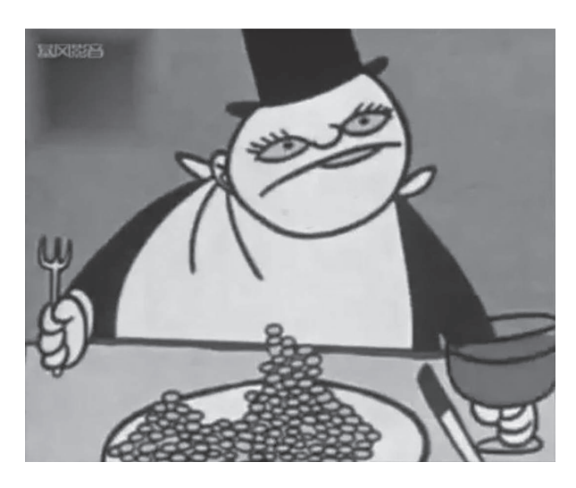
Figure 26.3 The winners are eating the gold coins, transformed from the killed ones, The Dream of Gold , 1963.

The cannibalistic metal dinner sequence depicts the greed of Western capitalist countries and the internal competition, strife, annexation, and uneven distribution of wealth and interests among them. The five strongest kings are served gold coins stir-fried by General Cannon and blood wine prepared by Mr. Mosquito in the kitchen. The gentleman in the middle, the persona of the US, has a lion's share of the food. The gentleman on the right corner of the table is served with the smallest amount of gold coins. He tries to steal some metal food from the plate of his neighbor but is intercepted in time by his vigilant neighbor. Although they are all gluttonous, they still have different table manners. One eats slowly and chews carefully, followed by a sip of blood wine, while others eat more quickly and